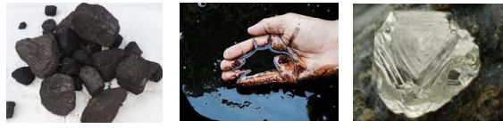
Coal Oil Diamond

Countries with mineral resources are more likely to develop quicker because they can sell these for profit.